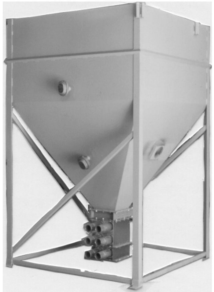
Eagle Surge Bin with Drain Stub, Slide Gate, Vacuum Distribution Box, Material Level Indicators, Roof Vent, and Roof Access Door

Sight windows or material level controls are used for inventory purposes.