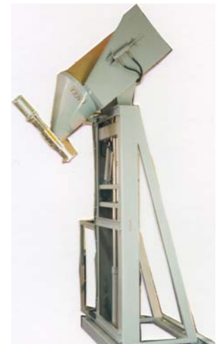
Drum Dumper Seal and High-Lift