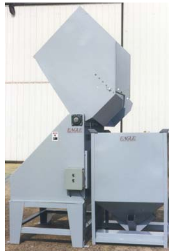
Standard Box Dumper